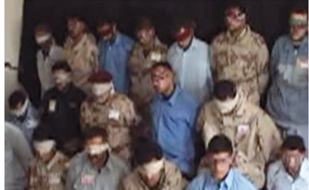
Terrorist networks and splinter groups view kidnapped Westerners as “prime chattel”.

The kidnapping of embassy staff and corporate executives from said countries at present and in the future is without question a goal of the jihadist alliance in Benghazi and elsewhere. Hasty and incongruent attempts at security will not offer the requisite protection for those who are being targeted by kidnapping organisations. The world continues to change rapidly and mitigating risk requires carefully planned tactics, techniques and procedures (TTP) in concert with 5Si intelligence that addresses all