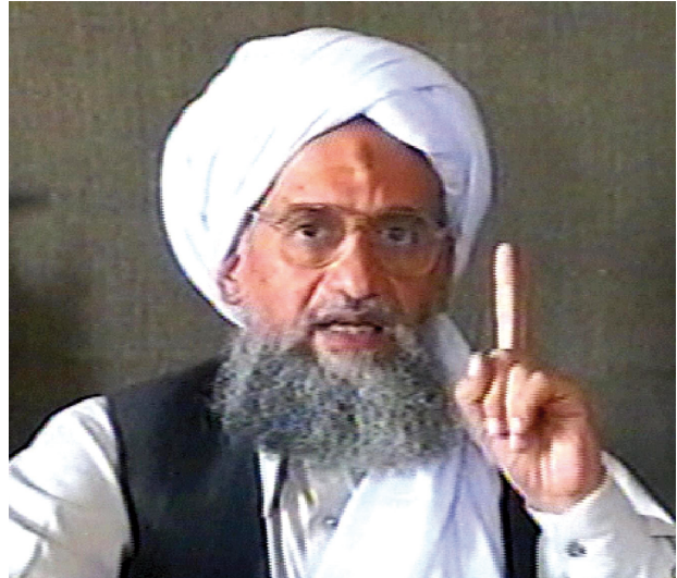
Al-Qaeda leader Ayman al-Zawahiri was purported to praise the deadly attack on the US Consulate in Benghazi, Libya on 11 September 2012.

subsequently drafted a cable describing and attributing the attack to the Imprisoned Omar Abdel Rahman Brigades. Leaflets left at the consulate by the terrorist subgroup promised more attacks on Americans.