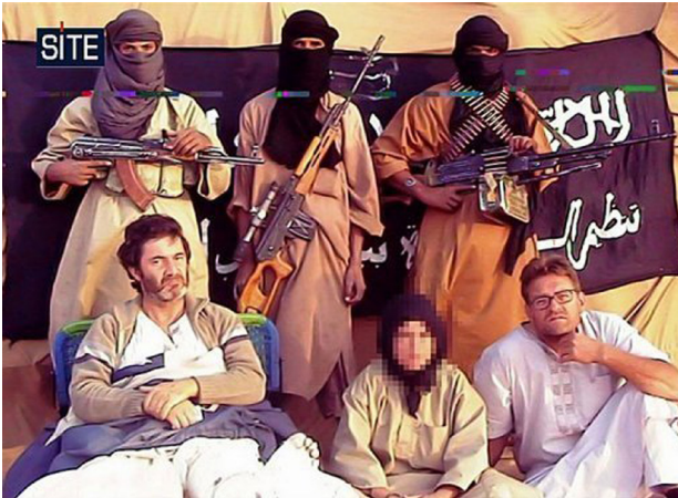
This image from the SITE Intelligence Group shows three Spanish aid workers alleged to have been kidnapped by al-Qaeda in 2009.